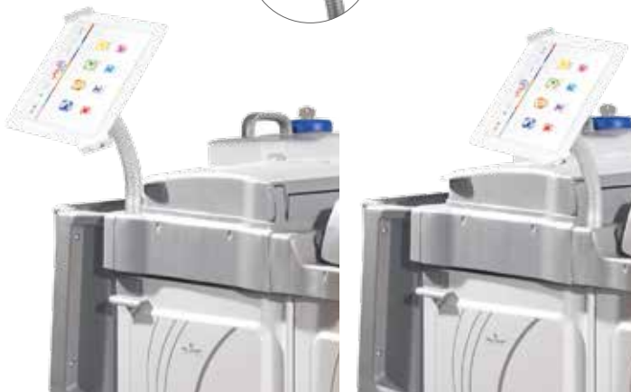
Two cart locations for installation; 360° cradle rotation