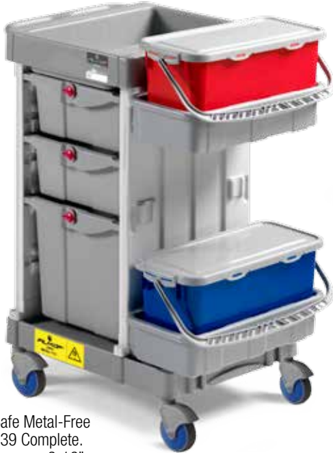
Alpha MRI-Safe Metal-Free Workstation 39 Complete. 3 lockable drawers, 2-16" Top-Down® Charging Buckets, 2-10" wide baskets, 5" wheel set-up Item# AX0236704U000